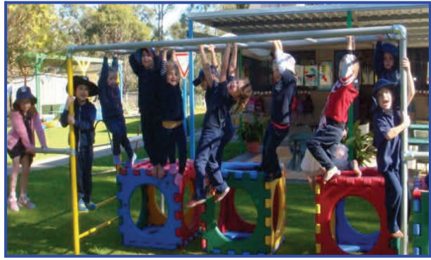
(The children mastering their new monkey bars )

Band Camp - Friday August 15 to Sunday August 17 at Woodman Point.