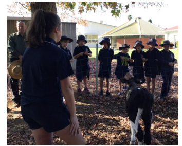
Year 2WM came for a visit