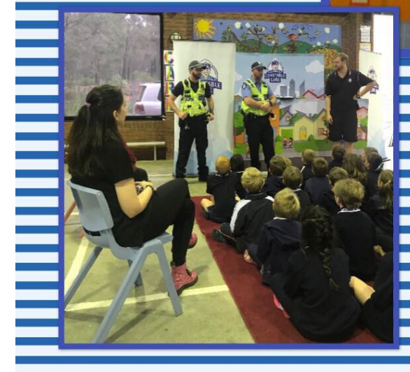
The Year One and Two students were very lucky to be joined by two of our local police officers who also watched the performance and said they would like to return to the Junior Campus for another visit.

The K-2 students were entertained by a wonderful Constable Care puppet play on Friday 12 October. All students displayed beautiful audience manners while learning some very important messages from Constable Care. The Kindy and Pre Primary classes learnt the safety rules for getting to school and the Year One and Two classes were asked to think very carefully about trust and the difference between fun-scary and bad-scary feelings.