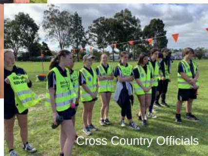
Cross Country Officials